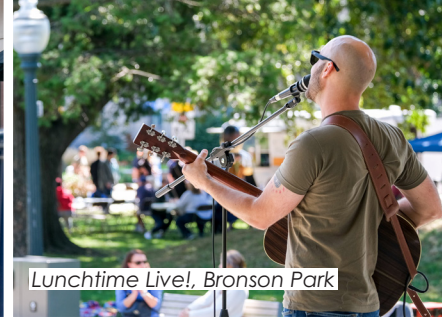
Lunchtime Live!, Bronson Park