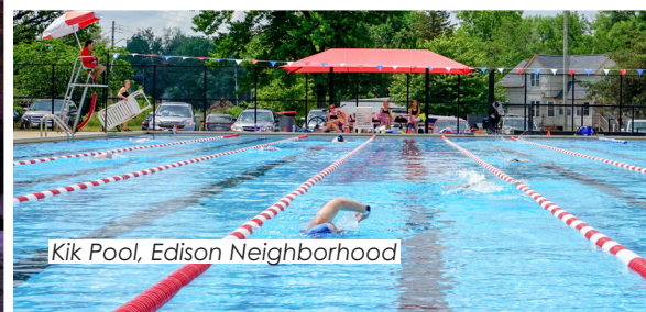
Kik Pool, Edison Neighborhood