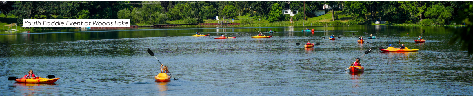
Youth Paddle Event at Woods Lake