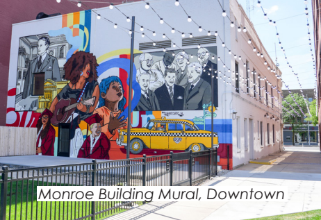
Monroe Building Mural, Downtown