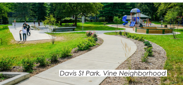
Davis St Park, Vine Neighborhood

The city has a rich history in pharmaceuticals and medicine, with companies like Upjohn shaping the industry and leaving a lasting impact on global healthcare . Today, this legacy continues with a thriving life sciences and medical research sector including companies like Zoetis, Stryker, and Pfizer. In 2021, President Joe Biden visited the Pfizer plant in the Kalamazoo area after the COVID-19 vaccine was developed. The Western Michigan University Homer Stryker M.D. School of Medicine was established in downtown Kalamazoo in 2012.