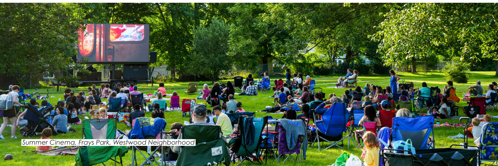
Summer Cinema, Frays Park, Westwood Neighborhood

With our world-class facilities, incredible arts and culture, highly acclaimed colleges and universities, endless recreational trails and excellent health care providers, it's no wonder that in 2023 U.S. News and World Report named Kalamazoo as the "4th Best Place to Live in Michigan."