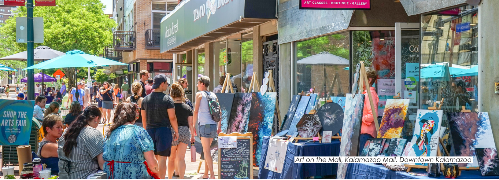
Art on the Mall, Kalamazoo Mall, Downtown Kalamazoo