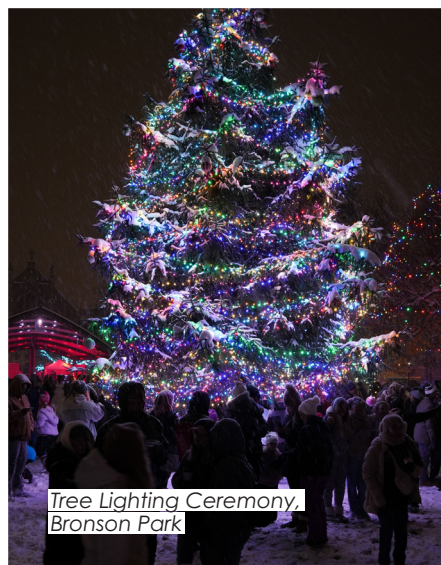
Tree Lighting Ceremony, Bronson Park