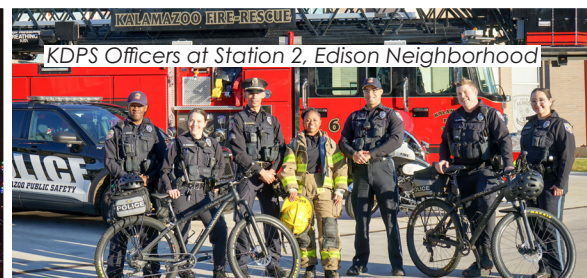
KDPS Officers at Station 2, Edison Neighborhood