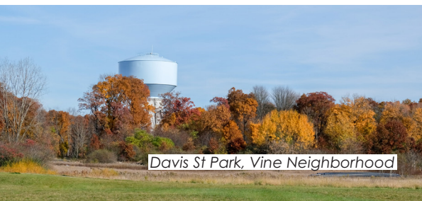
Davis St Park, Vine Neighborhood