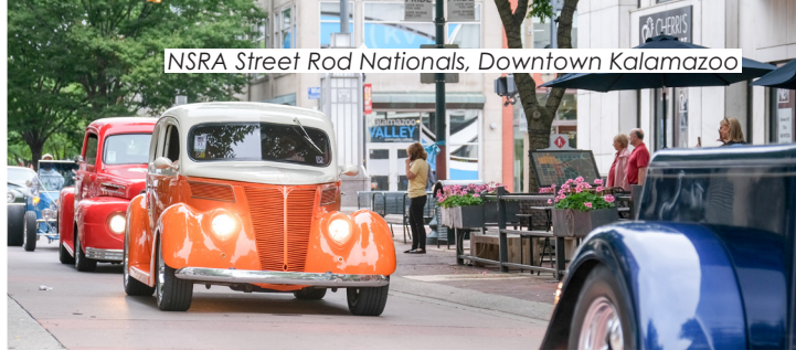
NSRA Street Rod Nationals, Downtown Kalamazoo